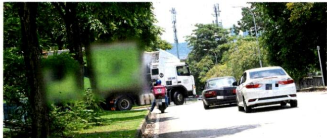
A trailer on Jalan Aman turning back around after discovering a height barrier along that stretch.

"Jalan Usaha runs between USJ 12 and USJ 16, and offers a faster connection between Subang Jaya and Shah Alam.