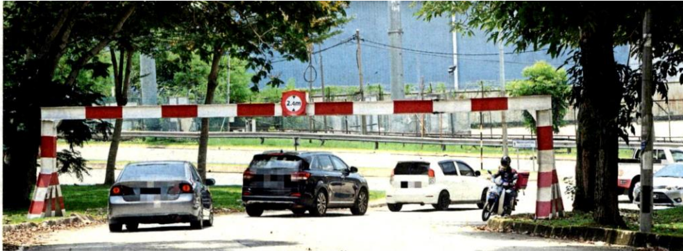
The height barrier in Jalan Aman, which was damaged a couple of days ago.

By VIJENTHI NAIR vijenthi@thestar.com.my