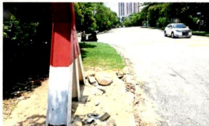
The remnants of the height barrier along Jalan Aman that was damaged and removed.

"The alternative route via Persiaran Kewajipan is longer. "The frequency of the barriers being hit on both roads makes one wonder if they were truly accidents.